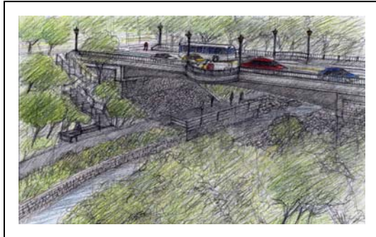
Bridge Alternative 2