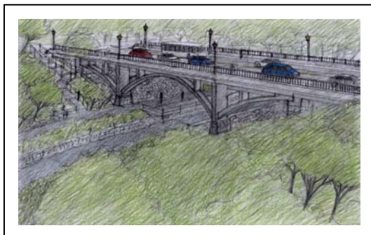
Bridge Alternative 4